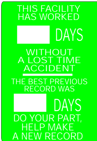
28x20 A-L DRY ERASE LTA-812451 A-L STEEL PLATE LTA-812457