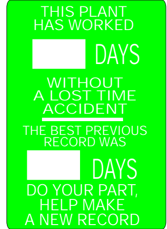
28x20 A-L DRY ERASE LTA-812351 A-L STEEL PLATE LTA-812357