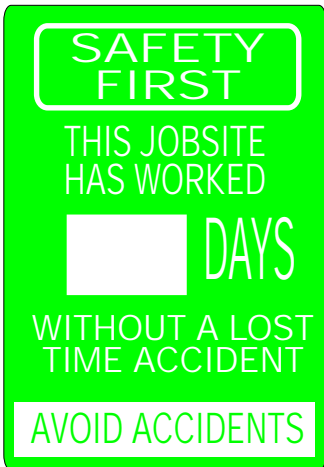
28x20 A-L DRY ERASE LTA-710951 A-L STEEL PLATE LTA-710957