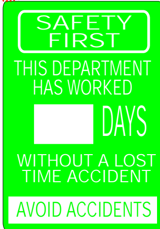
28x20 A-L DRY ERASE LTA-710751 A-L STEEL PLATE LTA-710757

LOST TIME ACCIDENT SIGNS ARE MADE OF ALUMINUM, 28"x20" (INCHES) AND HAVE A DRY ERASE AREA FOR DRY MARKERS OR A STEEL PLATE (MAGNETIC AREA) FOR MAGNETIC NUMERALS.