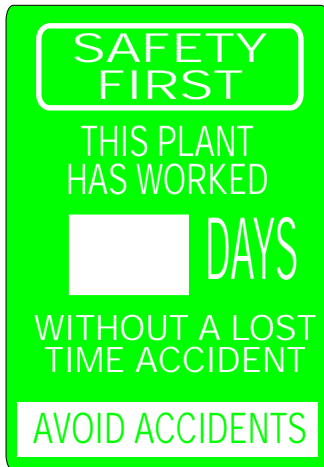
28x20 A-L DRY ERASE LTA-710851 A-L STEEL PLATE LTA-710857