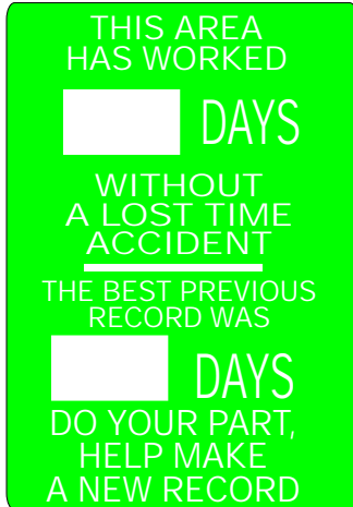
28x20 A-L DRY ERASE LTA-810951 A-L STEEL PLATE LTA-810957