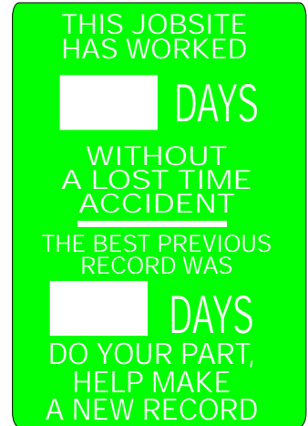
28x20 A-L DRY ERASE LTA-812551 A-L STEEL PLATE LTA-812557