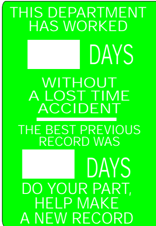
28x20 A-L DRY ERASE LTA-811051 A-L STEEL PLATE LTA-811057